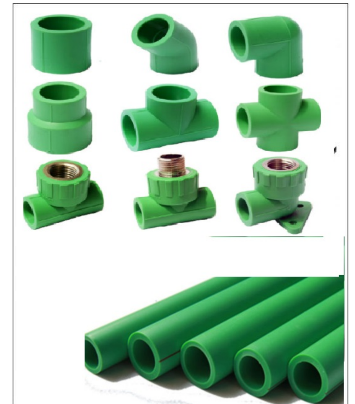
PIPES & FITTINGS